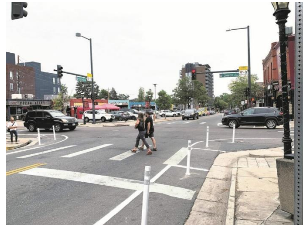
Painted curb extension/bulbout