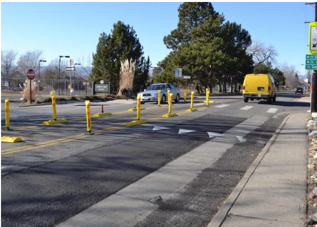
Painted pedestrian refuge island